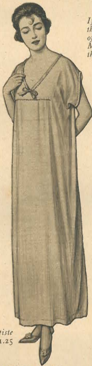
No. 4. Pink batiste nightgown, $1.25

No. 1. The stout woman will welcome this solution of the problem of buying a moderately priced blouse ready made. It's of white voile trimmed with tucks and embroidery, and with collar and cuffs edged with valenciennes insertion and lace. Sizes, 46 to 56 bust. Price, $2.95. No. 2. What could be a more charming addition to your wardrobe than this cool frock of checked voile? Note the deep organdie collar with voile band, the tucked organdie vest and the dainty organdie frills on the skirt tabs. The skirt is laid in box-plaits and the waist is gathered to a shoulder yoke in front. The dress comes in white checked in tan, pink and blue or red, blue and green or lavender, blue and green. Sizes, 34 to 44 bust. Price, $8.75.