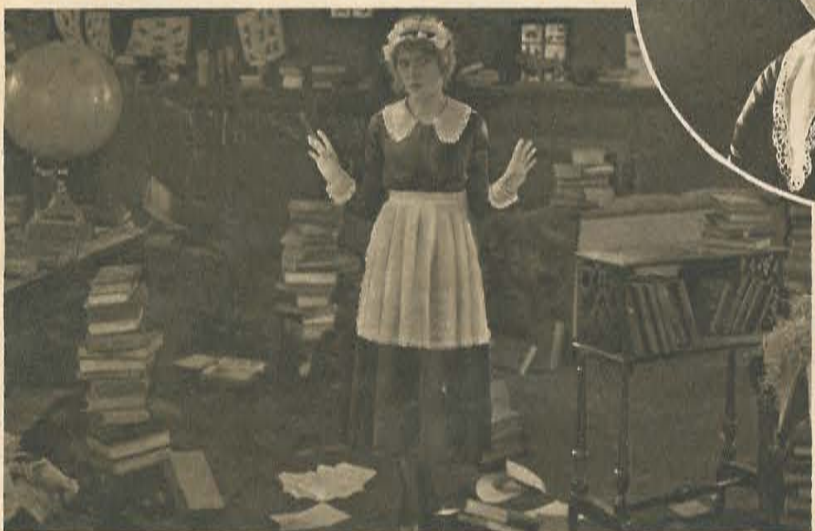
She is employed by the Bonners, an elderly couple who are so busy studying bugs and butterflies they don't care how their house looks