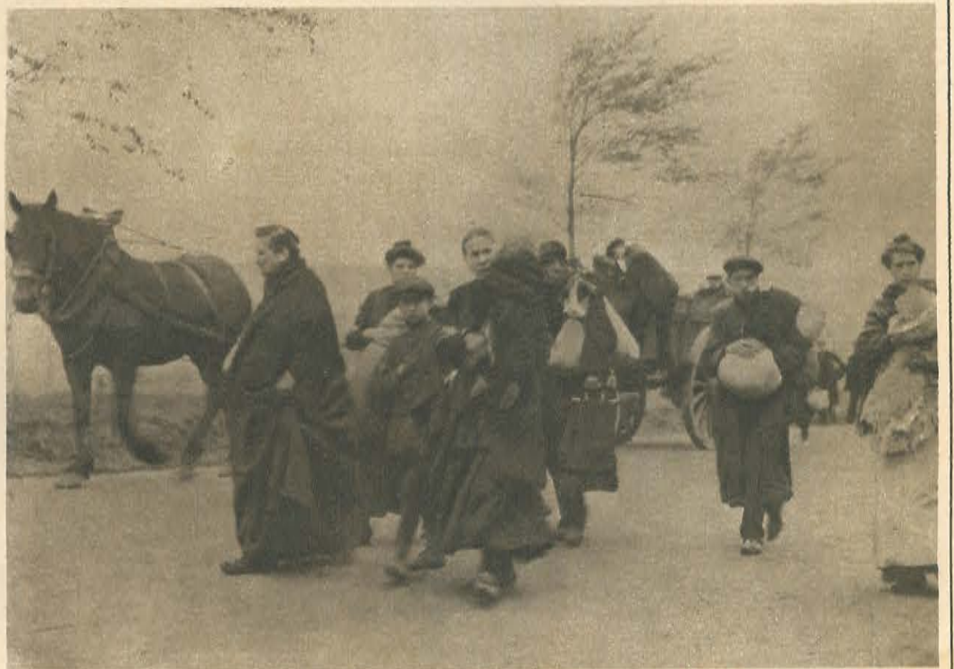
Fleeing from their homes, and the Germans. We try to imagine what this means—we can't. But we, whose homes are yet safe, who still have plenty to eat and wear, can surely give these poor stricken people something out of our abundance. There are suggestions on page 4.