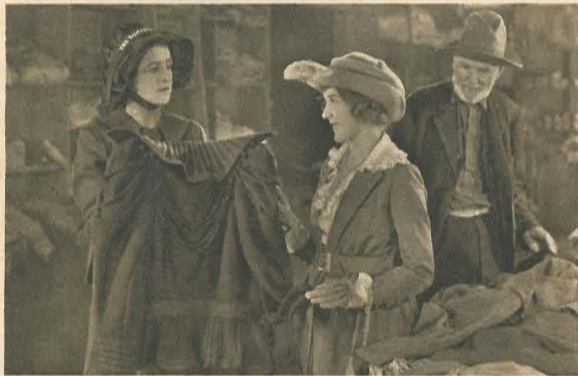
Jean discovers that a well-dressed, attractive girl can't get a job as a cook, so the Salvation Army shop supplies a disguise