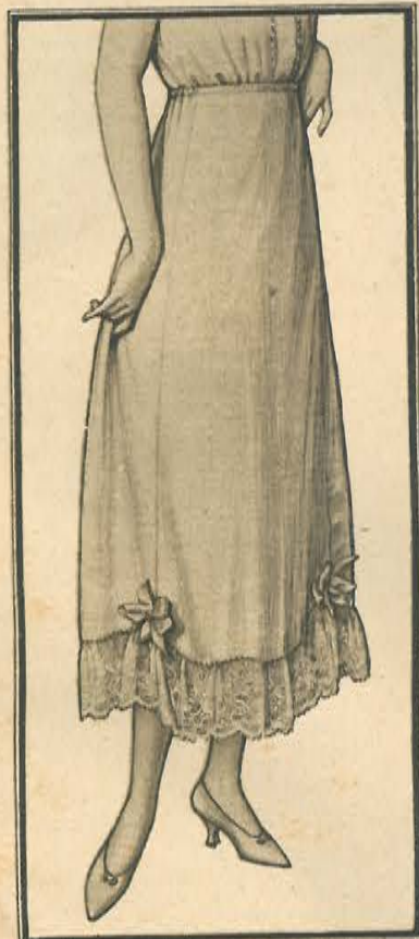
No. 3. Lace-trimmed petticoat, $1.95

No. 7. Large colored enameled beads give the style note to a costume. These are oval in shape, and graduated in size. Length, 25 inches. They come in green, red, lapis or turquoise blue. Price, $ .95.