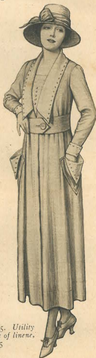
No. 5. Utility dress of linene, $4.95

Remember Miss Gould's Inquiry Department when you need help in your clothes difficulties.