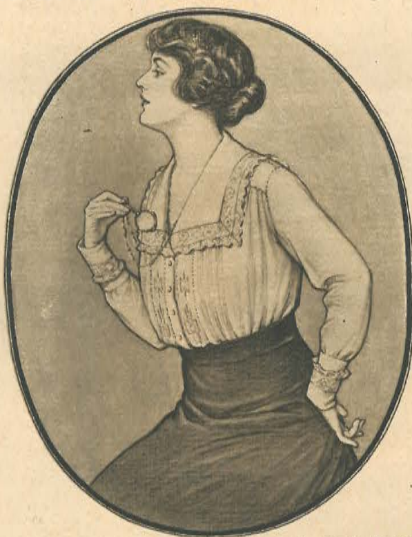
No. 1. White voile waist for the stout woman, $2.95