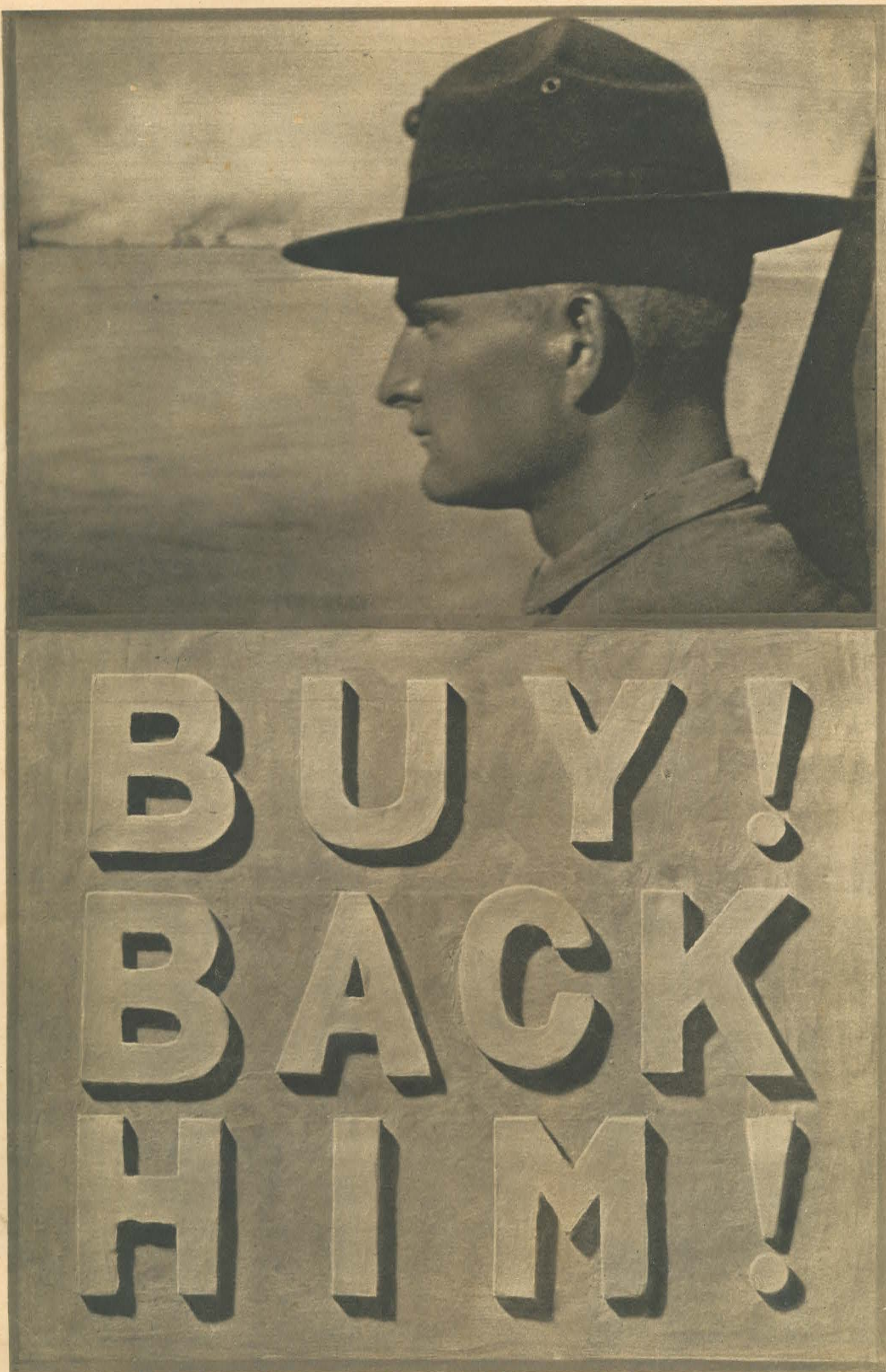
A Thrift Stamp Poster with a Message for Everyone