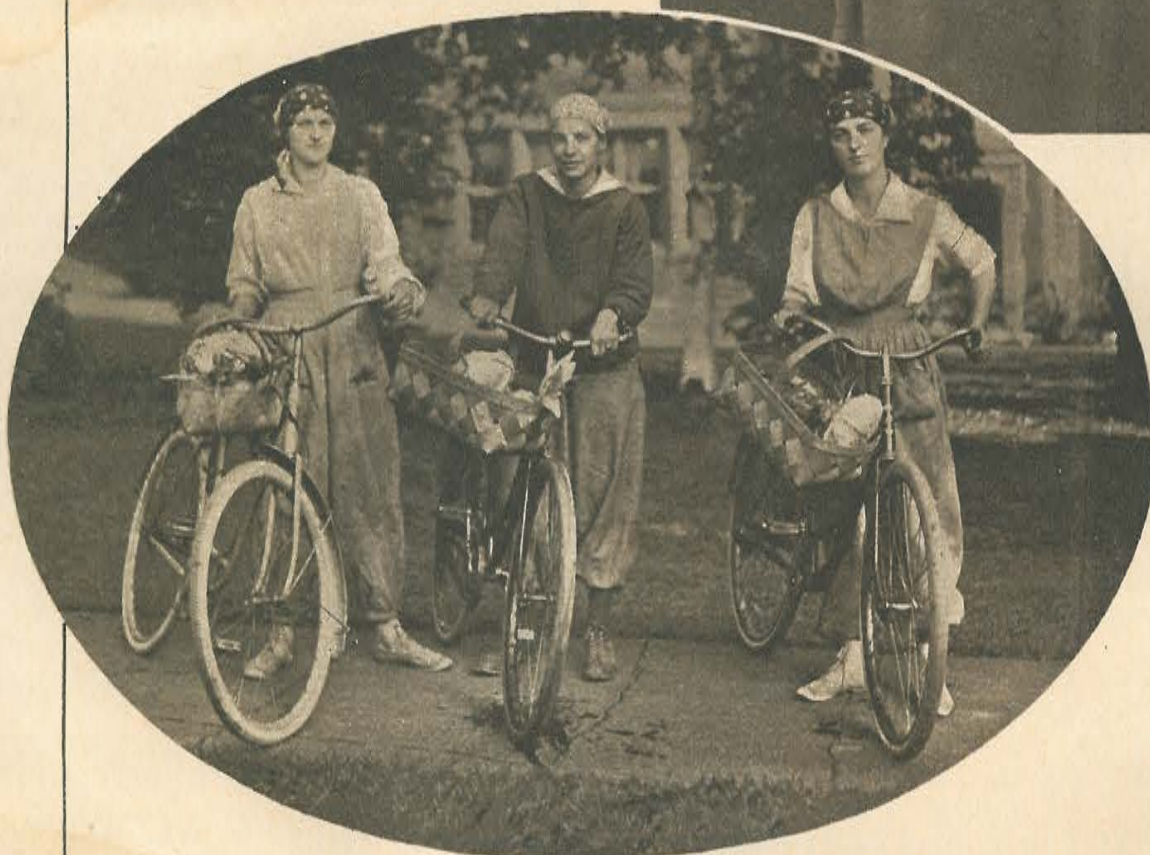
The almost obsolete bicycle is used by these indefatigable Mount Holyoke girls, who are not content with raising fine vegetables on the College Farm but actually deliver them, fresh-picked, at the consumer's door.