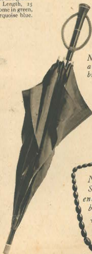
No. 6. Sun and rain umbrella, $3.25

Any purchase not satisfactory may be returned, but goods must be sent back to the shop within seven days of their receipt. Always state if garments are for exchange or refunded money. Do not return to the WOMAN'S HOME COMPANION. Return direct to the firm that makes the shipment to you, by insured parcel post or prepaid express, and accompanied by the sales slip which is always sent by the shop with each purchase. We cannot be responsible for returned packages lost in transit unless sent as directed.