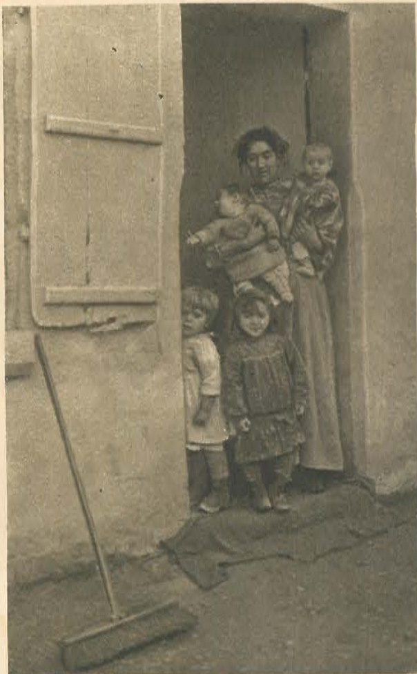
Nothing but bread soaked in water have these babies had for twenty-two months—and it costs only ten cents a day to feed them properly. Please help. See page 4.

N O, POOR little tot, no one has adopted him yet; but he's not going to let go of the nice young man who has rescued him until someone does —that's certain. How about you?