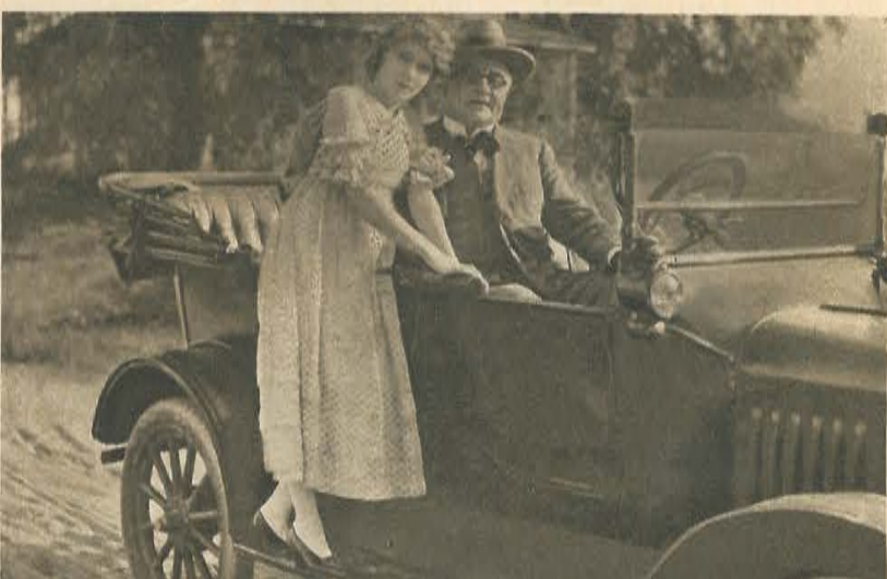
And at the end, Jean marries the erstwhile hired man, and Mr. Burton gets a most desirable daughter-in-law, so everybody is happy