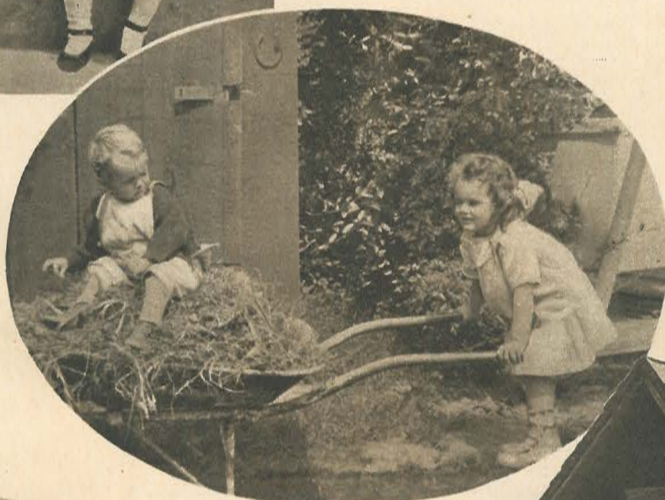
Whether the wheelbarrow's full or empty, Brother always wants to ride on it.

IF YOU'VE been watching the threshing machine and the stacker at work, and running round the hot old threshing engine, you do get so thirsty. But on the shady side of the first strawstack you'll find a great big jug full of a most delectable drink, and all wrapped up in a wet gunnysack to keep it cool. Take both hands and tip it way up!