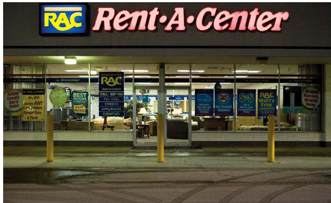
At right: Rent-A-Center Store on Broadway (Merrillville, IN), 2007.

Today's anti-thrifts are not new. Some have been around for decades, and others, like the pawnshop, for centuries. But until recently, they existed as small operations located on the fringes of the financial world. Since the 1990s, they have aggressively moved into new markets and become national franchise operations, some with ties to the corporate banking industry.