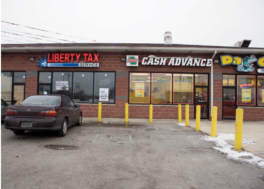
At left: (top) Access Cash Advance on Broadway (Gary, IN); (bottom) Allied Cash Advance on McGalliard Road (Muncie, IN), 2007.