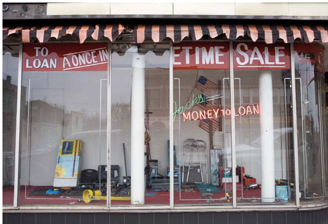
At left: Jack's Pawn Shop on Broadway (Gary, IN), 2007.

I N MID-TWENTIETH CENTURY AMERICA, a strapped wage earner who needed extra cash to pay an overdue utility bill, repair the family car, or make the rent had limited ways to get the necessary funds. Family and friends were often the first source of a short-term, possibly interest-free, loan. Failing that, pawn shops would take a wedding ring, musical instrument, fur coat, or some other piece of personal property as security for a small, high-interest loan. As a last resort, the local loan shark could provide the cash at predatory interest rates.