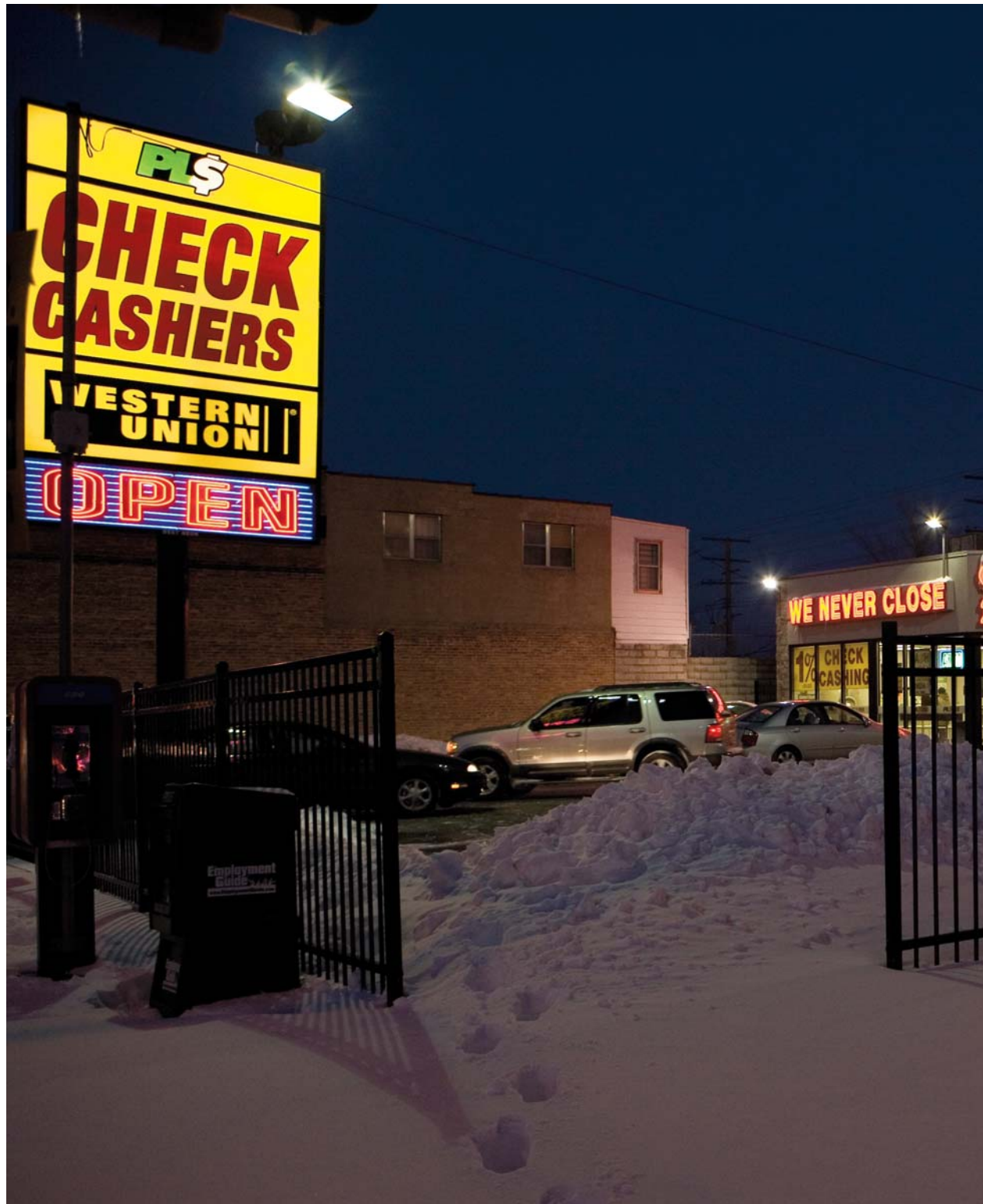
At right: Check Cashers on Broadway (Gary, IN), 2007.