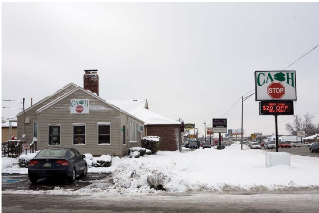
At left: Cash Stop on McGalliard Road (Muncie, IN), 2007.

But the most striking transformation has occurred in the financial services on McGalliard Road. Fifteen years ago, branches of local banks and a few personal loan companies made up the financial institutions on the road. Today, the bank branches remain, but they have been engulfed by a tide of payday lenders. Along