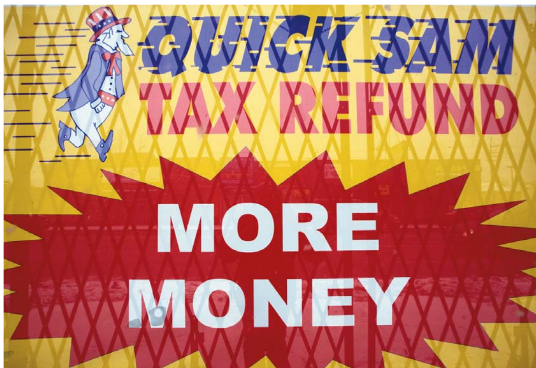
At left: Sign from Quick Sam Tax Refund on Broadway (Gary, IN), 2007.

Filene turned to the model of cooperative credit associations, small groups of members with preexisting ties to each other who pooled savings and provided one another with low-cost credit. Rooted in the principles of economic democracy and mutual aid, the cooperative credit movement originated in Germany in the nineteenth century and later spread through Europe and into the corners of the British Empire. During a trip to India in 1907, Filene encountered these “people’s banks” and came away impressed by the savings and microlending opportunities that they offered to the poorest villagers. Similarly impressed by the models of “ caisses populaires ” in Canada, Filene saw the credit union as the institutional means for realizing