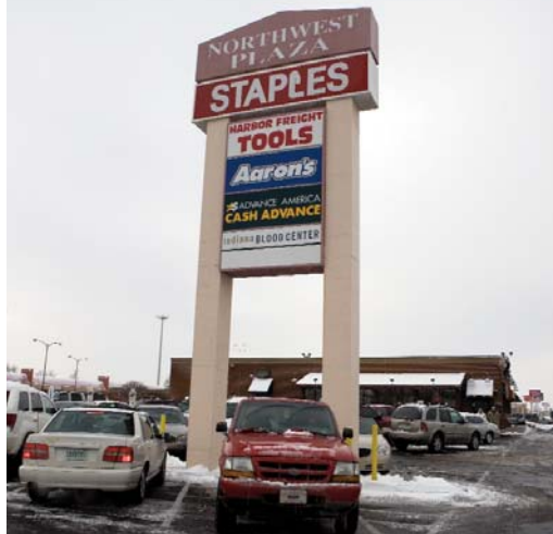
At left: Signs from various strip malls located on McGalliard Road (Muncie, IN)