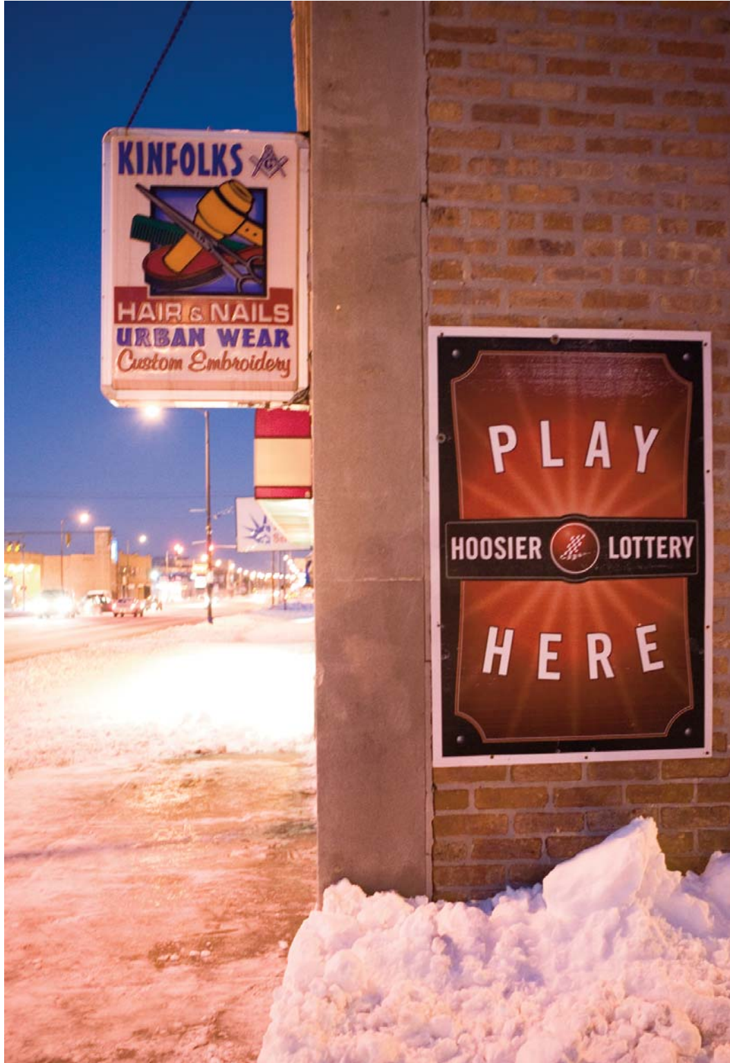
At left: Hoosier Lottery Sign on Broadway (Gary, IN), 2007.