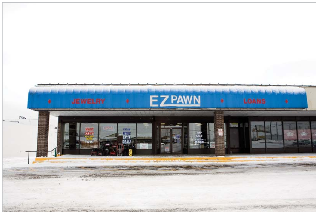
At left: EZ Pawn Shop on McGalliard Road (Muncie, IN), 2007.

One strategy was to make the small loan business more profitable for banks and other legal lending institutions. The reformers essentially agreed with the bankers: Restrictive usury laws kept commercial lenders out of the consumer credit business and fed the growth of the illegal loan sharking businesses. By increasing the interest rates allowed under the law, however, the reformers hoped to create an incentive for banks to get into the consumer lending business. Once legal lenders got into the business of making personal loans, they believed, loan sharks would be driven out.