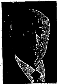
Adolph Lewisohn, Chairman National Thrift Committee