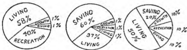
Mr. Spendthrift's Dollar